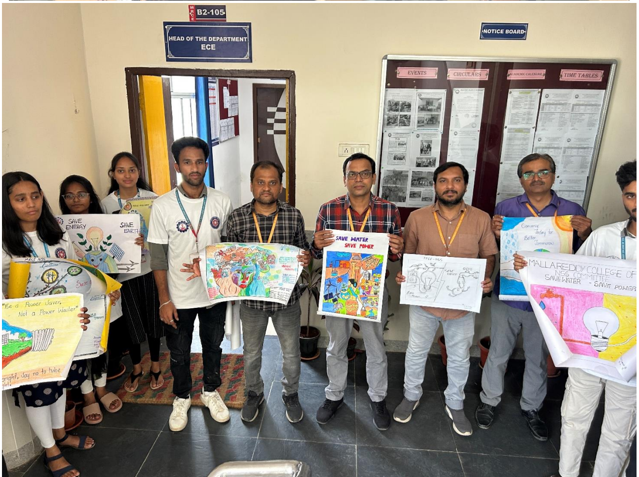
Classroom Campaigning Department-Wise