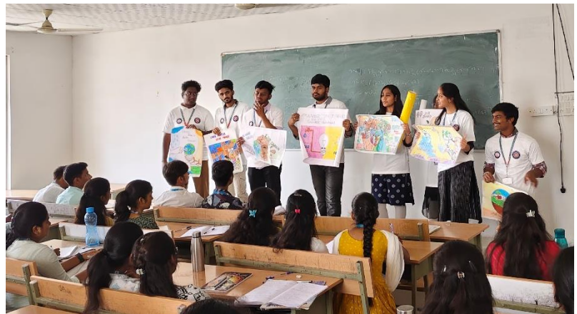
Classroom Campaigning Department-Wise